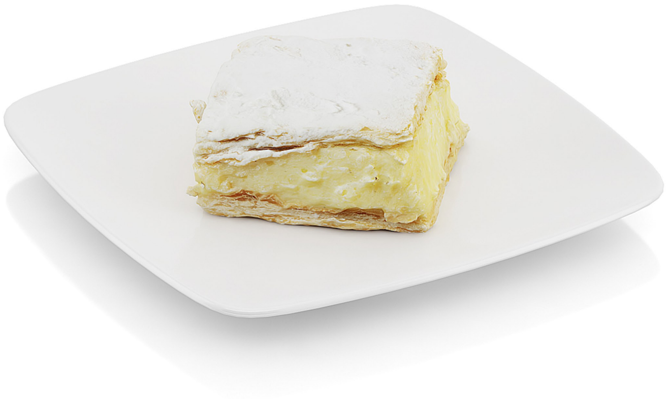
Piece of cream pie