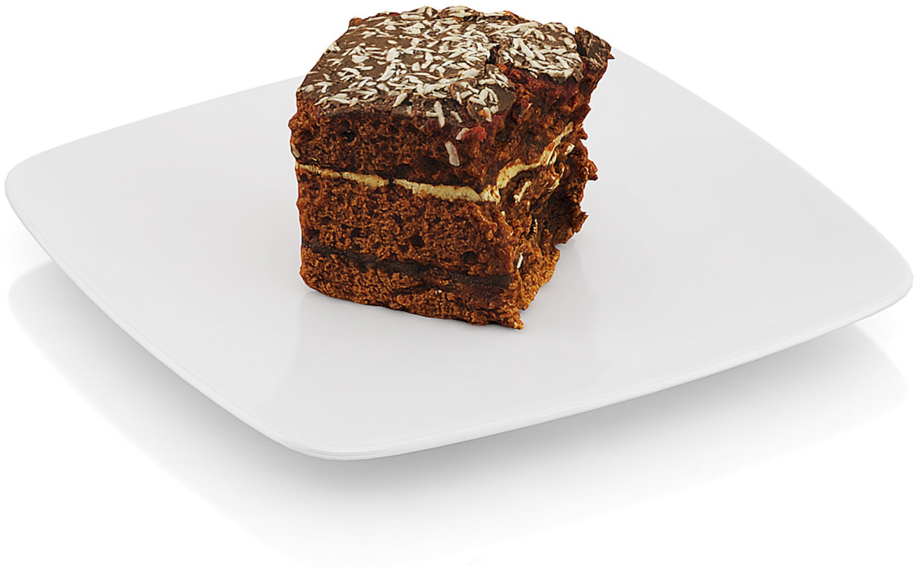
Half-eaten piece of chocolate cake