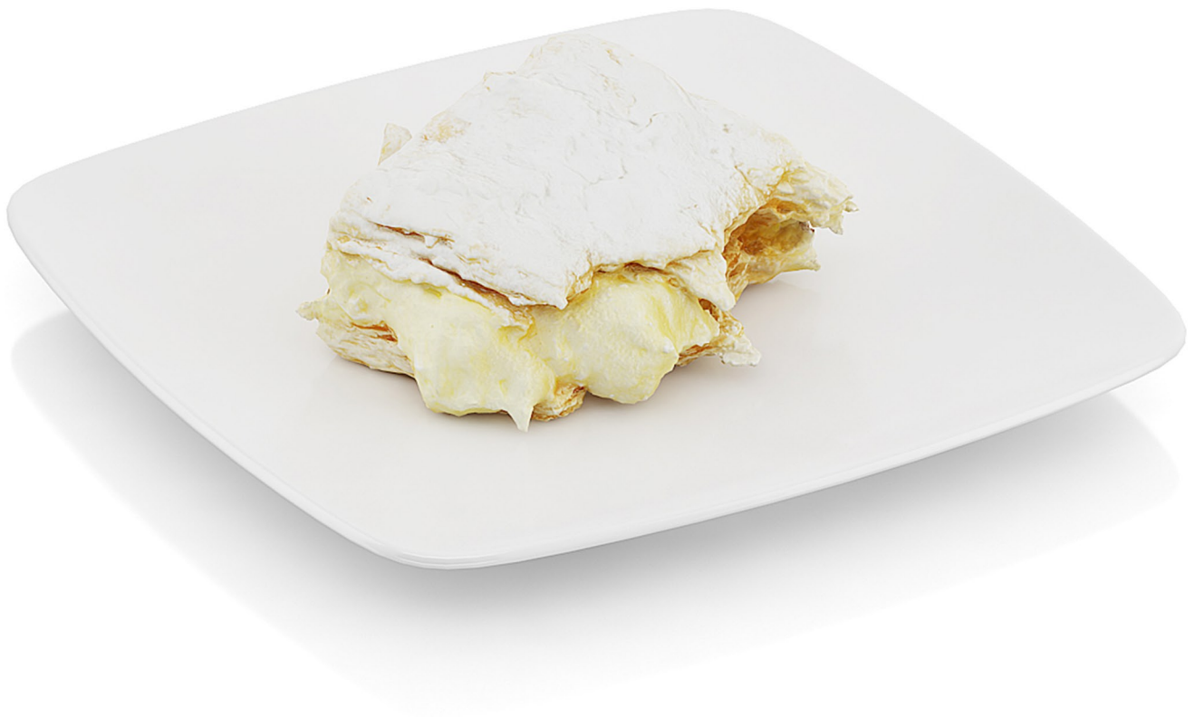
Half-eaten piece of cream pie