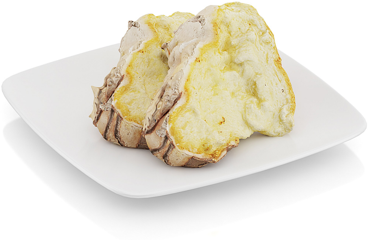
Two slices of cake with icing