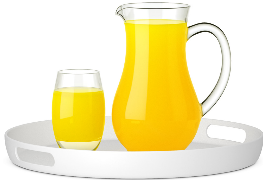
09. Pitcher and glass of orange juice.