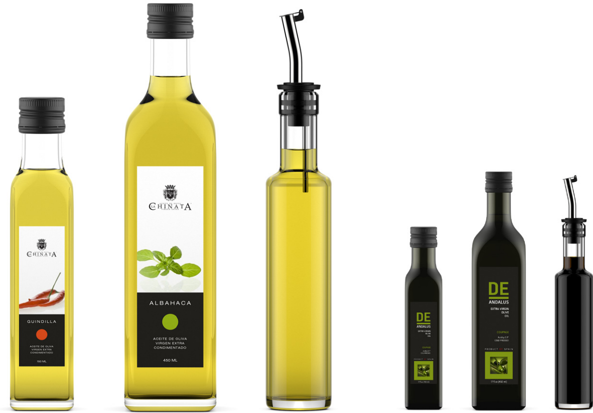
01. Olive oil bottles.