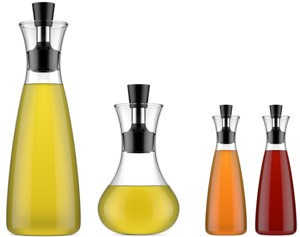
02. Oil and vinegar carafe.