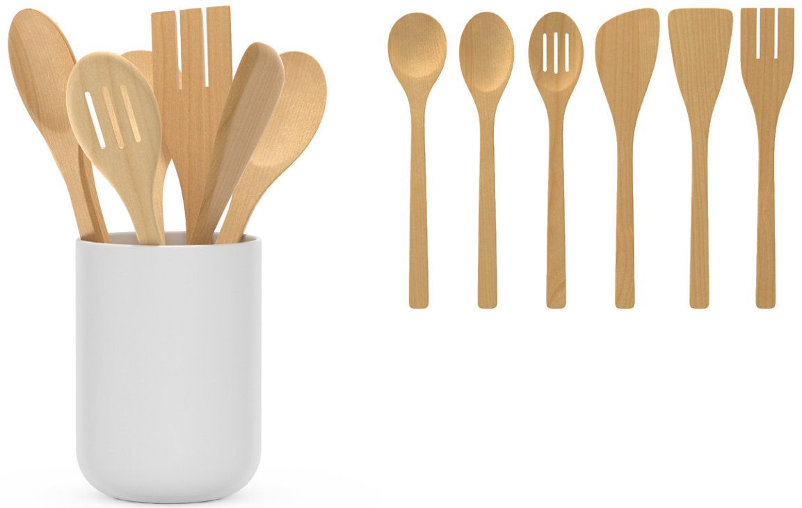
19. Kitchen wooden tools in a cup.