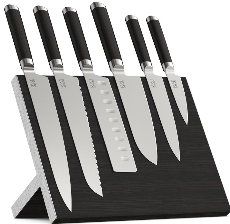
13. Knives set with stand and wall holders.