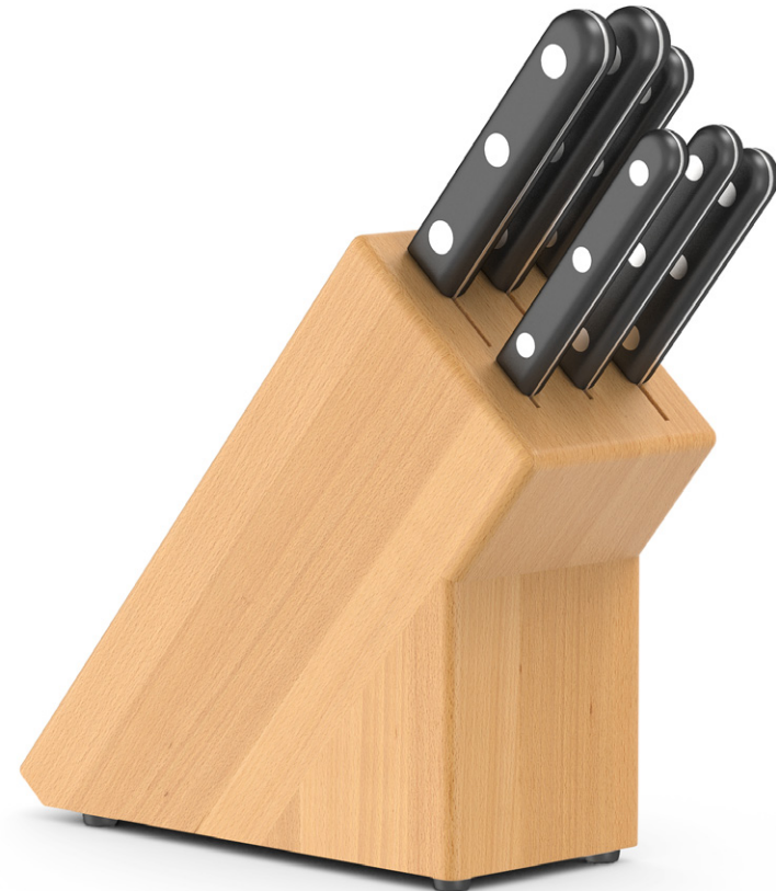
15. Knives set with stand and wall holders.