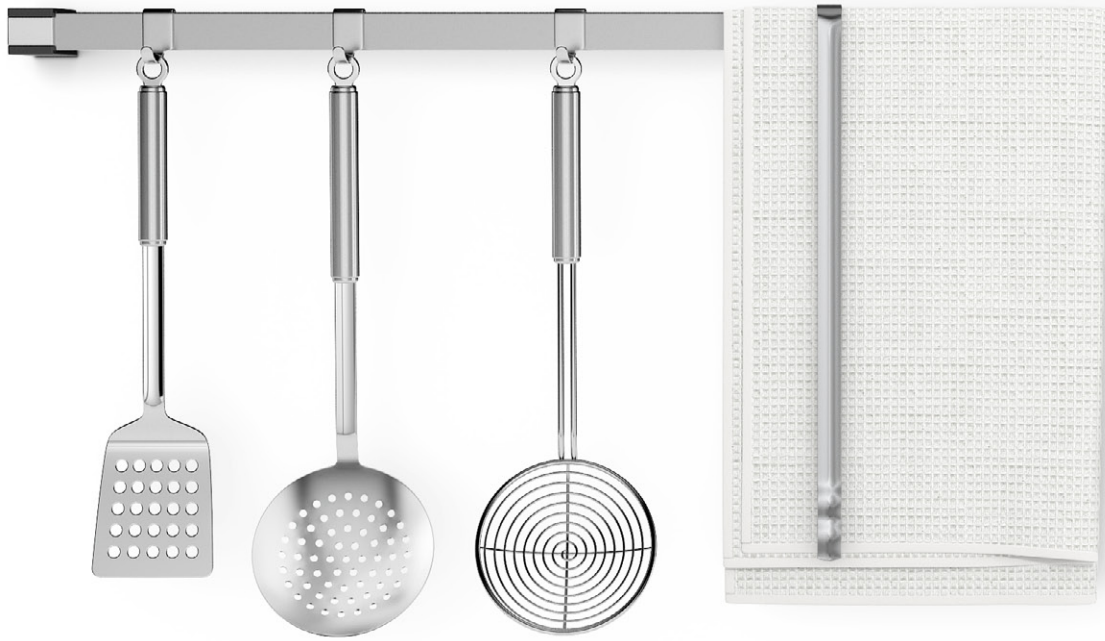
17. Kitchen tools on rail.