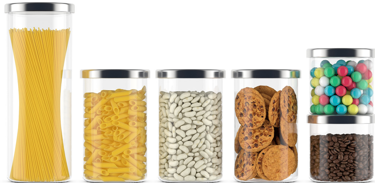
03. Food containers.