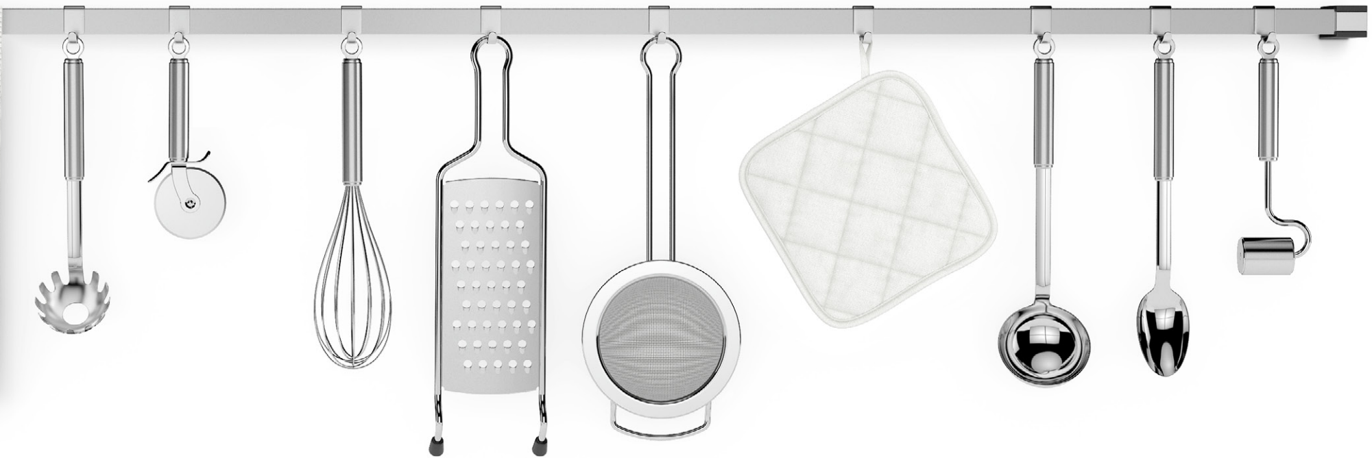
18. Kitchen tools on rail.