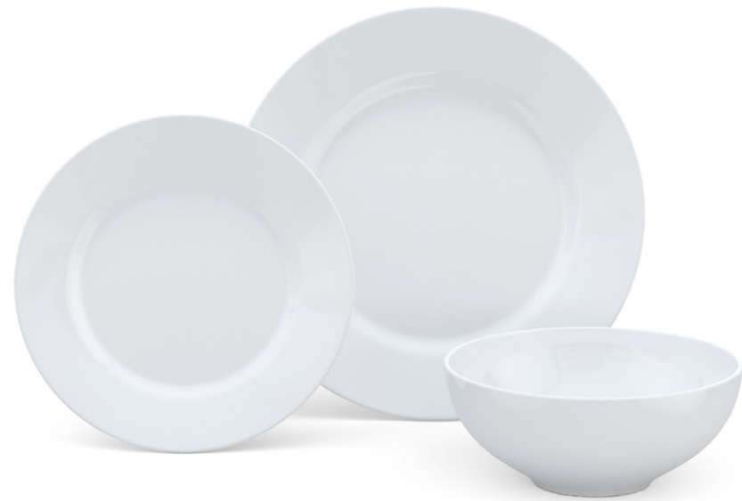
Set of round plates.