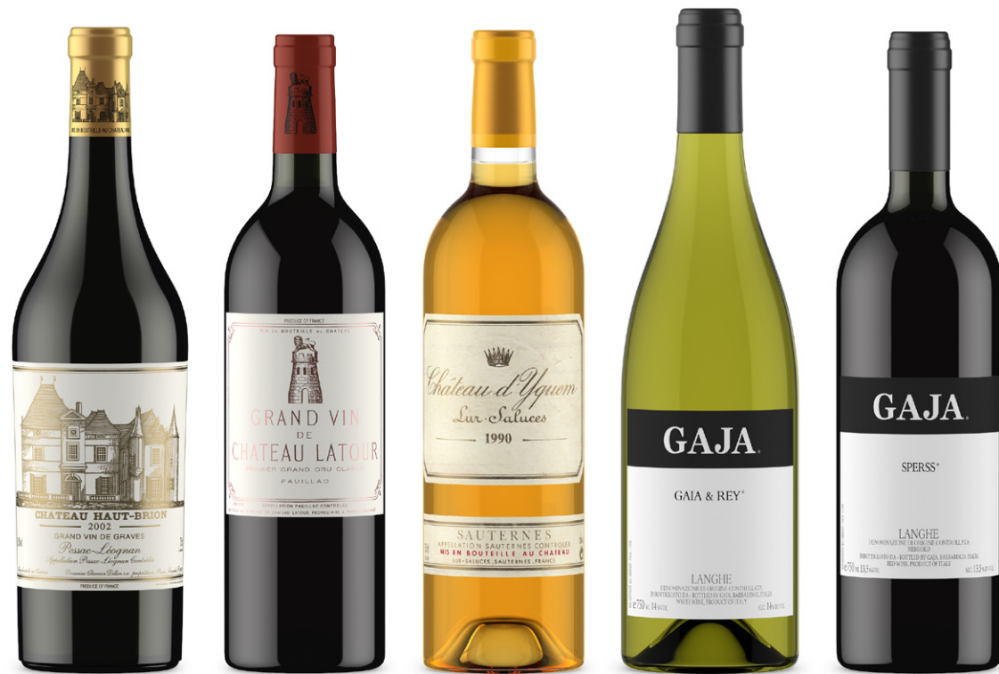
11. Bottles of wine.