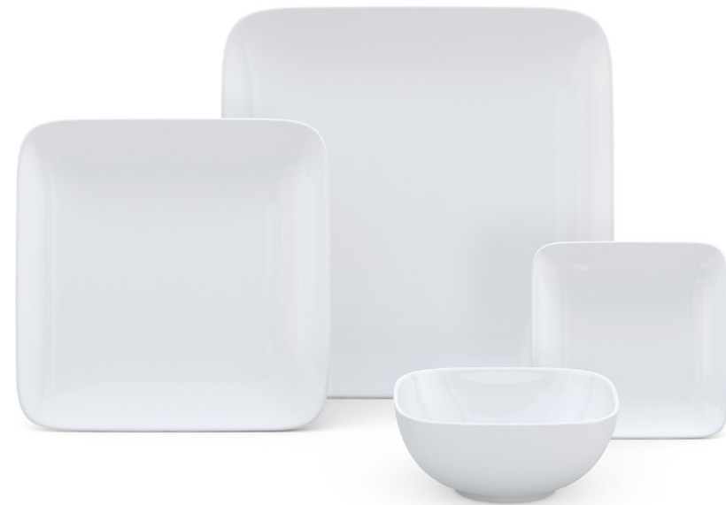
Set of square plates.