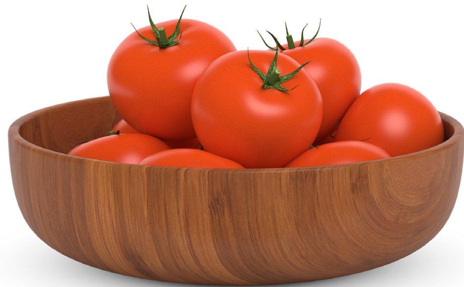
05. Tomatoes in a wooden bowl.