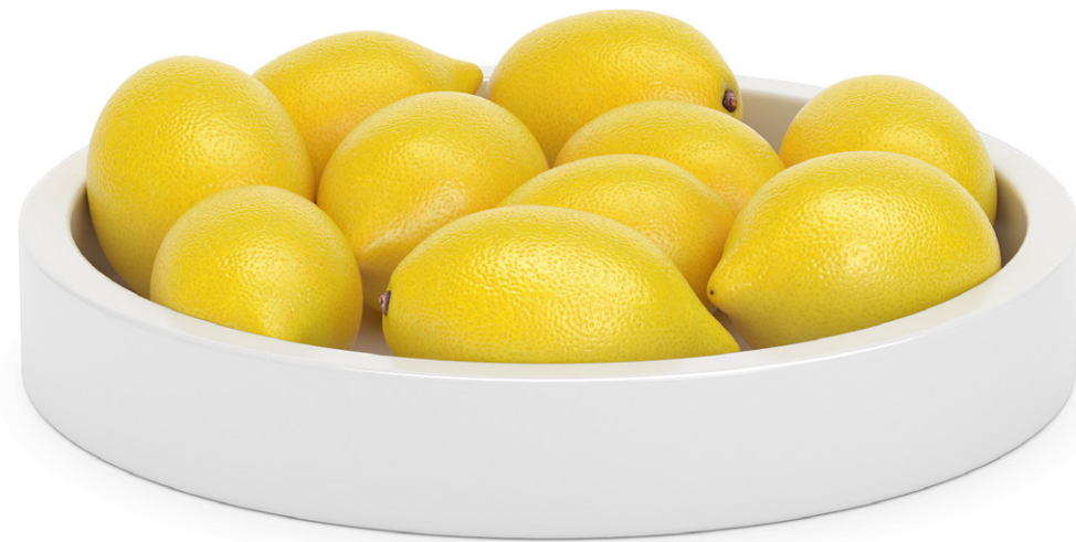
07. Lemons in a ceramic bowl.